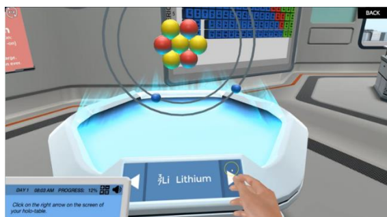
Figure 2. Simulation of Atomic Structure Material Introduction Using Labster